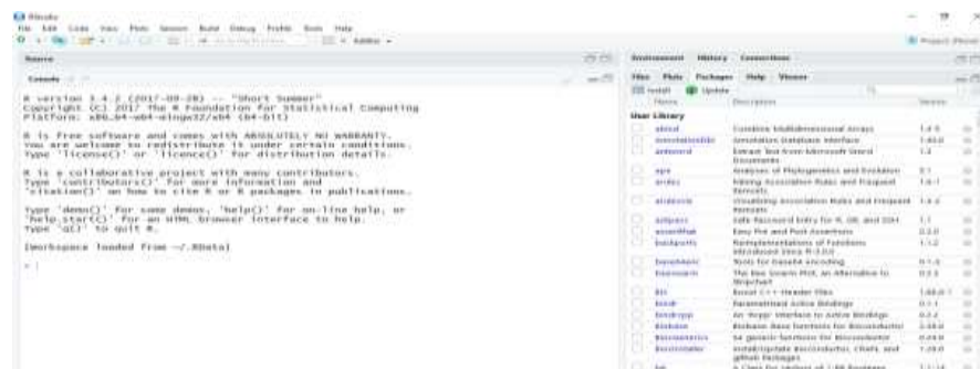
Fig 4.1 : Loading the required libraries to check the performance of the services of the different cloud services.