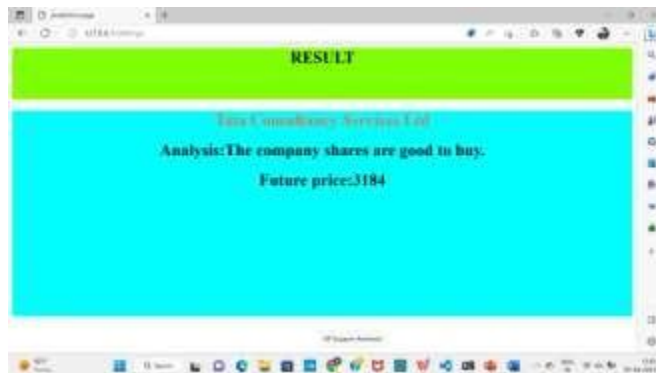
Fig-2: Analyzing the shares of company