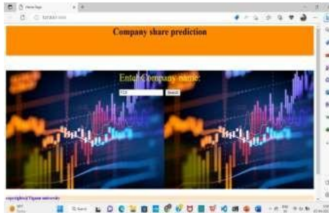
Fig-1: Search for company name