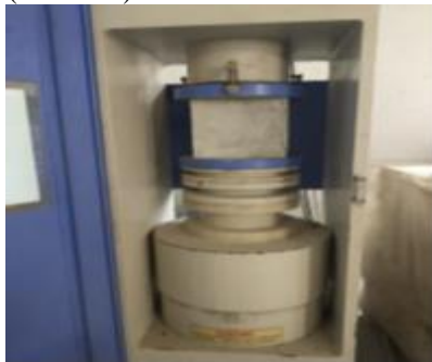
Fig-4.2. Specimen loaded into testing machine