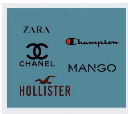
Figure 4 Different clothing brands.

The sizing chart for men's clothing is identified in the Figure 2. This assists the man in choosing the proper size that fits him, and he can then order the item in accordance with the sizes, styles, colours, etc. The sizing chart for women's clothing is identified in the Figure 3. This assists the woman in choosing the proper size that fits her, and she can then order the item in accordance with the sizes, styles, colours, etc. The purpose of a size chart is for our customers to be able to know what size to order to best fit them. The customer will have to measure themselves and see which size is the closest match according to their body measurements. Sizing guides usually give the exact range of inches for every size offered. If the user did not identify the cloth by using the picture the recommender system gives the description about the cloth like brand, color, pattern and cloth type. It recommends through the ratings. Customers can buy with confidence as they can choose their own fittings and the brand ratings of the product may give them a better chance to get best outfits [4]. The reviews and the ratings given by the other costumers will give them a chance to make faster and more informed purchasing decisions.