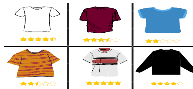
Figure 1 Ratings from the customers.

The recommender system is very peculiar in a way that their recommendations depend on different monsoons and the type of situation the costumer need. Based on the gender recommender systems provides many models and designs. Recommendation system have described many research in different ways. Classification makes the essential data easy to find and retrieve. Recommender system categorize the choices of the users. It also works on different type of functionalities like colour, size, brand, fittings and the most is the pricing. As an example, the customer chooses a colour the system gives all the products available in that colour. Figure 1 shows the ratings of the particular fashion product like jeans t-shirt, pants, sweaters etc. that is given by the customers so that the customer can choose his item and see the given ratings by customers, and he can opt it out.