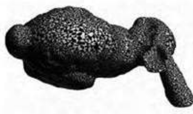
(a) Reconstruction standard threshold is 0.3

The reconstructed mesh density is obtained in the cases of different thresholds of reconstruction standard, as shown in Fig. 3.