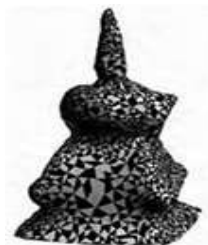
(d) Reconstruction standard threshold is 0.5