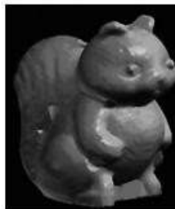
(c) Reconstruction of squirrel model without preprocessing