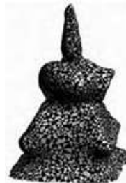
(c) Reconstruction standard threshold is 0.4