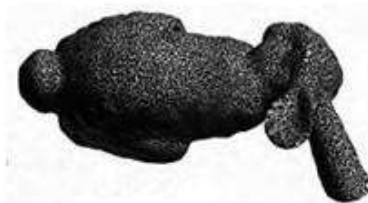
(b) Reconstruction standard threshold is 0.35