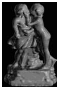
(b) Reconstruction of sculpture model with preprocessing