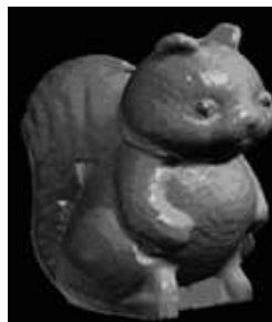
(d) Reconstruction of squirrel model with preprocessing