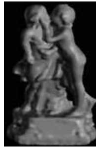
(a) Reconstruction of sculpture model without preprocessing

squirrel model without preprocessing while Fig. 4(d) with preprocessing.