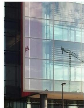
Figure: Elevations of Kings Place, London, Dixon Jones

Double Skin Façade: A distinctive feature of Kings Place is its double skin façade, meticulously designed to marry tradition with innovation. Dixon Jones has artfully composed a façade that not only pays homage to traditional design elements but also incorporates modern functionality. This design choice creates a visually appealing exterior while addressing practical considerations such as energy efficiency and acoustic comfort.