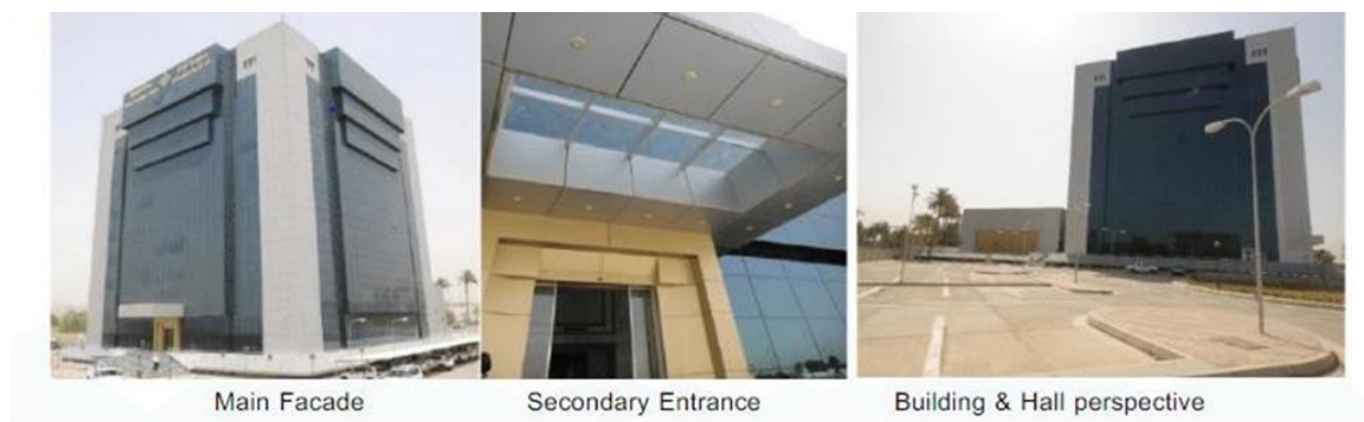
Figure: showing the façade system

Architectural Design: The façades of this architectural marvel are conceptualized as a single skin, featuring double glazing. The choice of materials is notably aluminum, ensuring both structural integrity and a sleek, modern aesthetic. Interestingly, the corners of the building deviate from the aluminum norm, incorporating concrete for added strength and resilience.