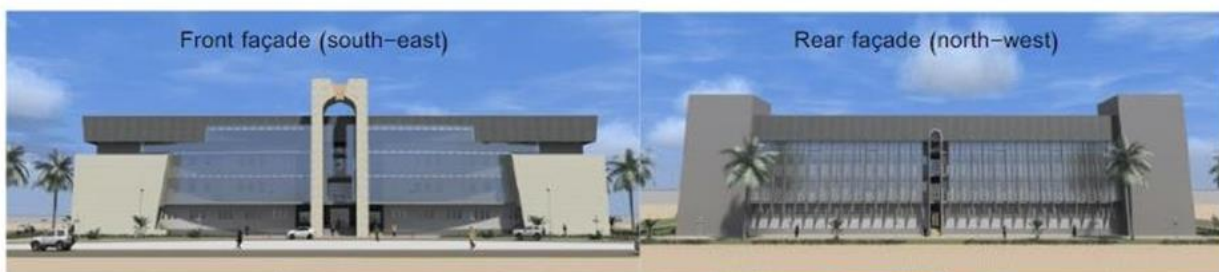
Figure: figure showing elevations

Nestled in the heart of Baghdad, the Sunni Endowment Bureau's building, constructed between 2010 and 2014, emerges as a testament to contemporary architectural finesse. The façades, distinguished by a double skin design, not only contribute to the building's aesthetic appeal but also embody a deliberate interaction with the surrounding environment.