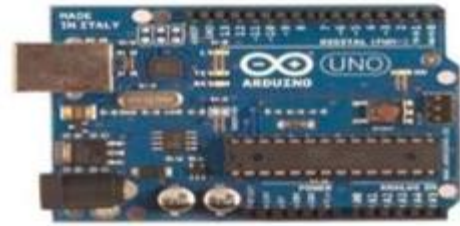
Fig.1 Arduino Uno

The open-source microcontroller board Arduino Uno is built around the ATmega328 microprocessor (datasheet). A 16MHz crystal oscillator, a reset button, 14 digital I/O ports, a power jack, a USB port, an ICSP header, and a USB port are all included in the Arduino Uno. Everything needed to get the microcontroller up and running is included in the system, including a choice of power sources (battery, AC-to-DC adapter, and USB connection to a computer). A 5-volt DC power source is required to operate the device. The Arduino UNO is simple to use and packed with useful capabilities. It is a data transmission medium that connects the solar panel to the Internet of Things.