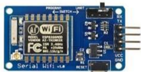
Fig.2 Wi-Fi Module ESP8266

The Espressif Systems ESP8266 is a Wi-Fi microcontroller with a full Micro Controller Unit (MCU) and TCP/IP protocol stack. We believe the cost is reasonable. The most common application of this technique is embedded IoT application development. The ESP8266 bridges the gap between the microcontroller and the cloud server. Before being uploaded to an IoT or Cloud server, data gathered by an Arduino device must be processed by an ESP8266 module.