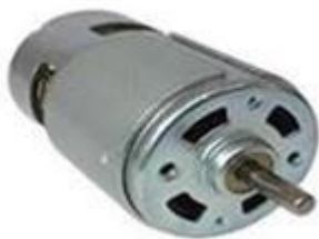
Fig.4 DC Motor

Motors are machines that transform electrical signals into mechanical rotation; they typically consist of a stator and a rotor with a permanent magnetic field. It is feasible to keep the magnetic field going by using electromagnetic windings or permanent magnets. Brushless, servo, and gear motors are among the many capacities and configurations of DC motors. These motors are typically used in applications that require a wide range of speed and torque. A control motor, namely a DC servomotor with a rotational speed of 10 rpm, is used in the application. The motor runs on the Pulse Width Modulation (PWM) principle, which states that the rotational angle of the motor is controlled by the duration of pulses transmitted to a specific control pin. A resistor connects all of the necessary components between the motor and the gearing, allowing the solar panel to revolve.