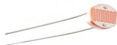
Fig.6 Light Dependent Resistor (LDR)

The value of a photoresistor or light-dependent resistor (LDR) varies in reaction to lighting. A Light Dependent Resistor's (LDR) operation is mostly dependent on photoconductivity. The resistance of the photoresistor varies in response to changes in illumination, making it a variable resistor. We can measure the solar power plant's light exposure by connecting the Light Dependent Resistor (LDR) to a constant voltage source via the Arduino ports.