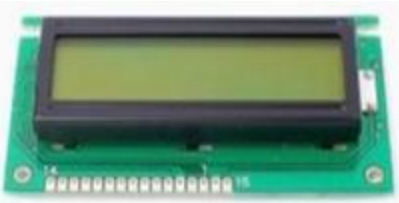
Fig.3 Liquid Crystal Display (LCD)