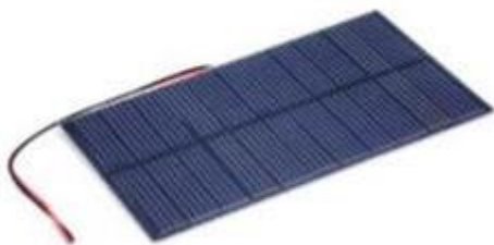
Fig.7 Solar Panel

The solar panel, also known as a photovoltaic module, is a device that converts solar energy into electrical energy by gathering sunlight. An array is made up of many solar panels, each of which contains a number of individual cells. The more solar panels that can be put, the more solar energy that can be harvested. Photovoltaic solar panels, or PV panels, are made of a semiconductor material that is chemically and electrically comparable to silicon. Photovoltaic panels provide direct current (DC).