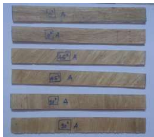
Figure 2: Test Specimens