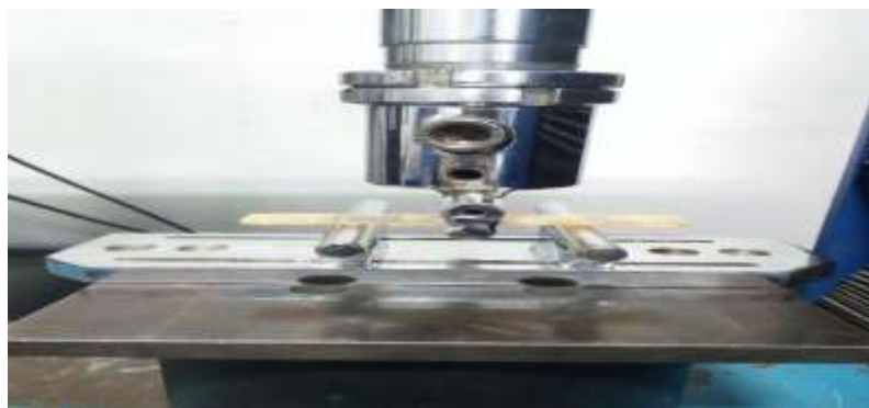
Figure 6: Mounting of Specimen on Flexural testing machine