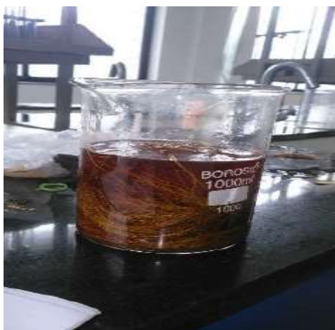
Figure 1: Chemical Treatment

Banana fibers obtained from local resources along with epoxy resin are the components used in this project. The density of the epoxy resin is 1.22 g / cc.[12] The epoxy resin is stirred thoroughly until fiber mattresses have been inserted into the matrix. Almost 24 hours later and under constant stress, each laminate in the mold was healed at room temperature. Banana fibers are obtained from local sources, as shown in the figure. After 8 hours, banana fibers had been removed from the fiber, dried out in the sun and dried out 24 hours in the oven.