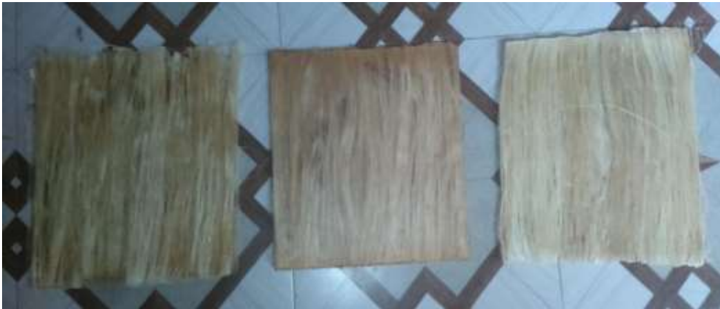
Figure 3: Final Fabricated Laminates