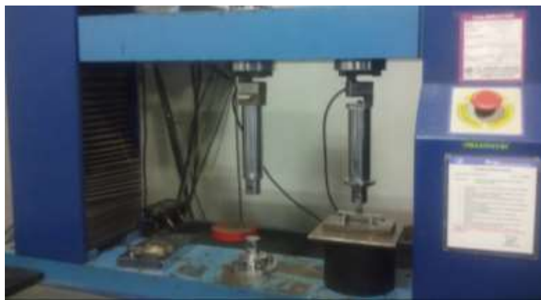
Figure 5: Flexural testing machine

Flexure research involves bending a substance instead of pressure to establish the interaction between bending force and deflection. [13] Delicate products like pottery, mortar, mud and glass are commonly used in Flexural processing. It can also be used to analyze the actions of materials that translate their normal life, including wire isolation or other elastomeric products. The test results also are susceptible to specimens, load geometry and stress, but there are also certain disadvantages to this approach.[12]