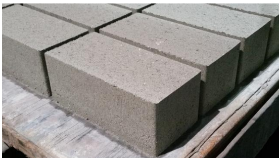
Fig. 2: Sprinkling water curing of bricks.