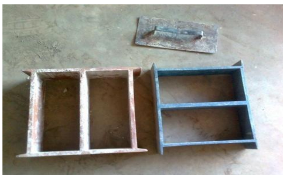
Fig. 1: Concrete bricks moulds.

A standard 190x90x90 mm brick specimens were casted for all above various types of concrete mixes. The samples were then stripped after 24hours of casting and are then be sprinkling of water for curing 7days (daily 2 times). As casted, a total of (28) 150x150x150mm bricks specimens were produced.