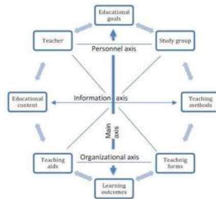
Figure 1: Didactic octagon (Andres, 2020)

Social Requirements: Social learning is a process that requires interpersonal skills such as commu-