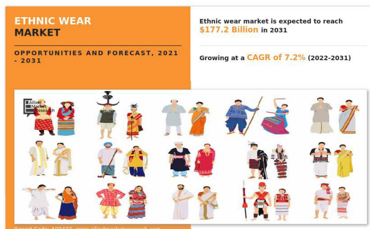
Image 1: Ethnic Wear Market Size, Share, Growth & Forecast expected to 2031.

In an increasingly digital world, digital marketing is essential for Indian ethnic wear brands to engage with customers, boost brand awareness, and increase sales.