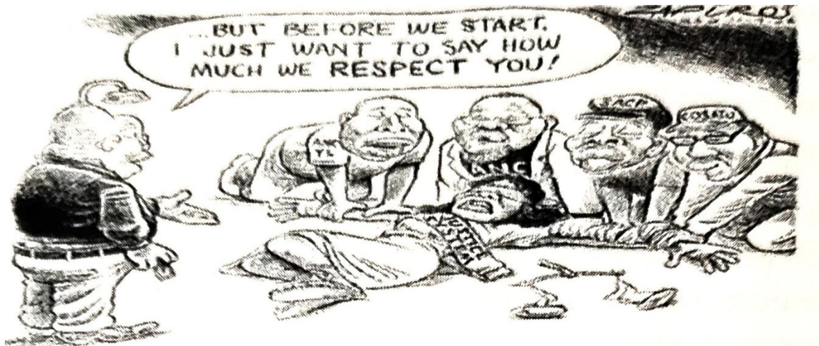
Fig. 2. Study of Rape

The paper describes dynamics of rape in the modern Indian society, and possible reasons for the crime. The history of rape law was traced, and current law with amendment was examined. Quantitative statistical analysis using correlation was employed on rape data with eleven socioeconomic-demographic predictor variables. It was found that literacy plays an important role in reduction of the crime. It may be mentioned that to effectively contain rape crime requires a fresh look with multidisciplinary approach to gain insight and find solution to the intractable social problem.