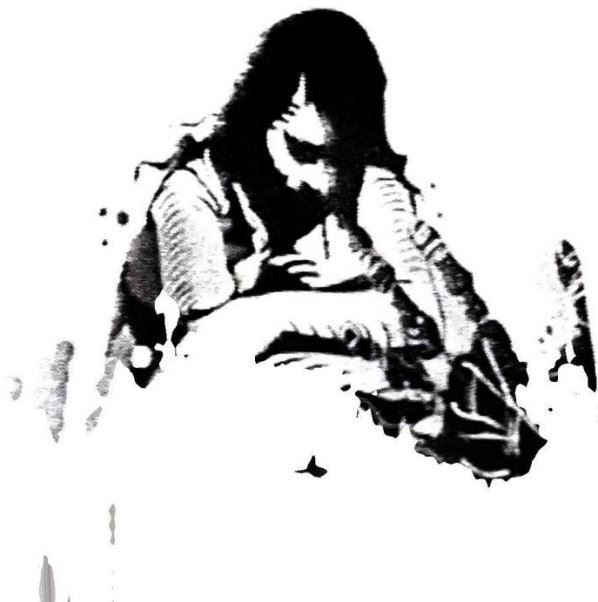
Fig. 6. Rape Study

The paper addresses dynamics of rape and models it as a space-time function. Rape is a multidimensional and dynamic phenomenon. The perception and understanding of rape may vary widely. The two extreme views of rape are liberal and radical and the rape is generally perceived in between these extreme views. The judgment of rape may therefore be V. K. Madan, R. K. Sinha