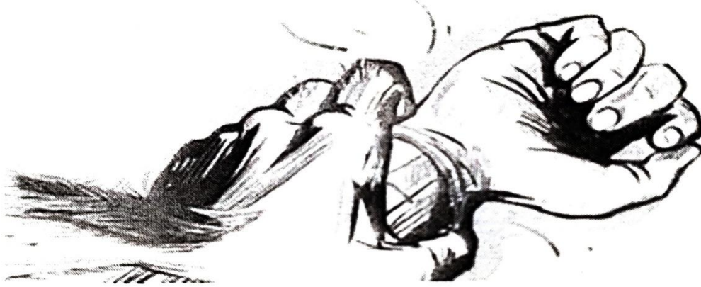
Fig. 1. Rape Study