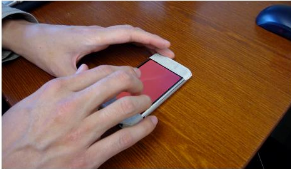
Figure 1: Participant using Slide Rule on a multi-touch Smartphone Slide Rule uses audio output only and does not display information on the screen.