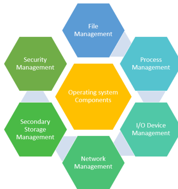
Figure 1: Illustrates the different types of operating systems [Google].

operating system features some of the fundamental features of an operating system is task management and resource management a few utilities, file management, and management functions. Features and operations of the operating system Depending on the period, have changed the needs of the clients or consumers. OS-based goods are viewed as products that are driven by technology. The functionality and features are modified as technology advances technology. Figure 1 illustrates the different types of operating systems.