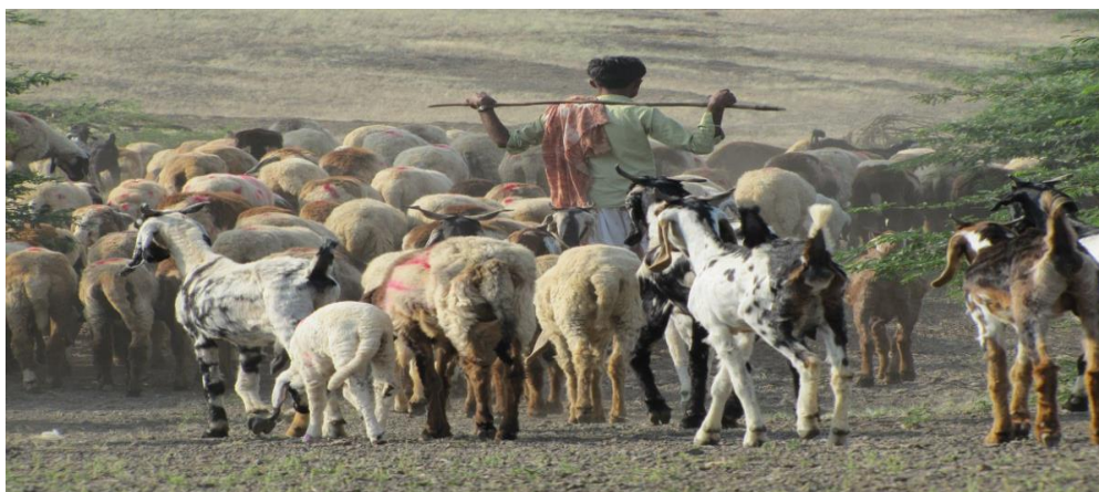
Figure 2: The above diagram shows nomadic herder searching for lands of green grass.

Figure 2 shows Nomadic herder searching for lands of green grass. As discussed above, Nomadic Agriculture is a practice in which nomads with animals searches for land covered with grass and other low plants suitable for grazing animals especially cattle or sheep.