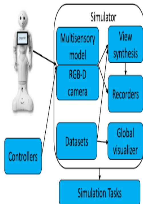
Fig.1: The architecture of simulator.

holes in the synthesized image. We first project a key image selected based on the angle, distance and overlap it has with the virtual view, to the virtual position, and then detect holes in the synthesized image. If the size of the largest hole is bigger than a threshold (e.g., 0.04% of the whole image), we then choose another input image to fill holes. We iteratively run this process until the size of the largest hole is smaller than the threshold or the number of input views reaches the maximum.