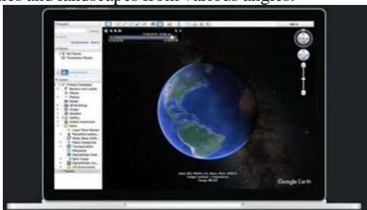
Figure 2: User interface of google earth pro software

Google Earth is a computer program, formerly known as Keyhole Earth Viewer, that renders a 3D representation of Earth based primarily on satellite imagery. The program maps the Earth by superimposing satellite images, aerial photography, and GIS data onto a 3D globe, allowing users to see cities and landscapes from various angles.