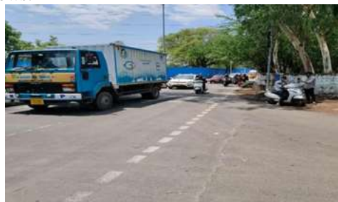
Figure 3.: Real time picture of alwal road

The study was conducted on two lane roads which connected to Alwal junction, it covers Alwal road, Bolarum and old-alwal road. These two lane roads selected because different types of vehicles use these roads to transport. Description of each road is as follows: