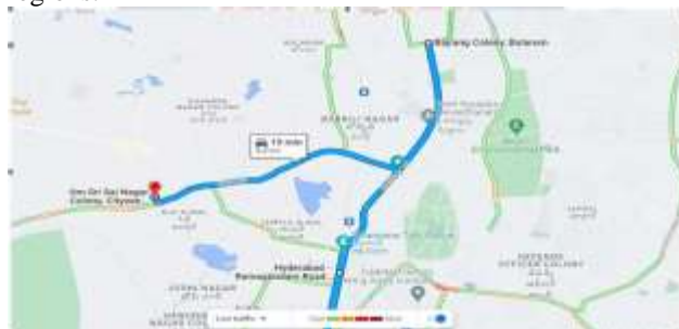
Figure 4: Road profile of old-alwal to Bolarum

that use this road. These vehicles comes from different zones of secundrabad region and medchal regions.