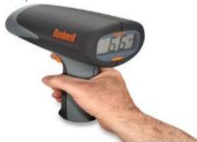
Figure 1: speed Gun

A radar speed gun is a doppler effect unit that may be hand-held, vehicle-mounted or static. It measures the speed of the objects at which it is pointed by detecting a change in frequency of the returned radar signal caused by the doppler effect, whereby the frequency of the returned signal is increased in proportion to the object's speed of approach if the object is approaching, and lowered if the object is receding. Such devices are frequently used for speed limit enforcement,