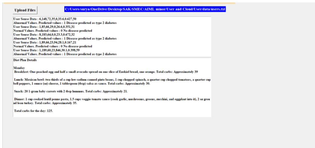
Figure 4: Model prediction on uploaded test data in user side GUI.

Figure 5 demonstrates the model prediction process on the uploaded test data within the user side GUI. Once the user uploads their healthcare dataset, the system utilizes machine learning models to predict the likelihood of diabetes based on the provided data. Prediction results are displayed in real-time on the GUI, allowing users to instantly access and interpret the outcomes. This figure provides users with actionable insights into their health status, empowering them to make informed decisions about their well-being. Figure 5 exhibits the proposed model's suggested diet plan based on the predictive analysis results. In cases where the analysis indicates the presence of diabetes or certain risk factors, the system generates personalized diet recommendations tailored to the individual's health needs. These recommendations are derived from evidence-based practices and dietary guidelines, providing users with practical strategies for managing their condition effectively.