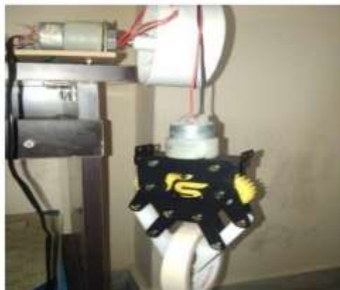
Fig 6 Object Pick Up with Help of Gripper

In stage 2 clipper is attached to the kit which performs the activity of pick and place which is used to pick the child from hole and it contains of camera, by this we get the visuals of the child and their condition.