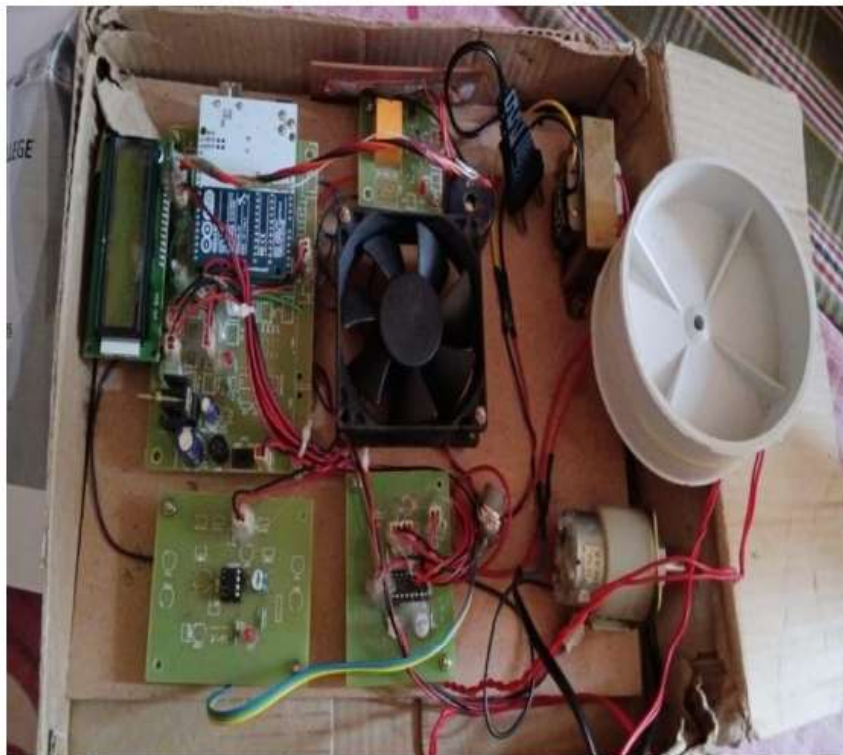
Fig 3 Final position of hardware kit