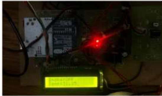
Fig 4 Output of Stage I Result

In stage 1 in this project, it contains of gases sensor which is used to find any harmful gases near the child and it equipped by temperature sensor which is used to find temperature near the child. Those gases and temperature are displayed on the display. By the stage 1 we are ensuring that the child is in safe place or not.