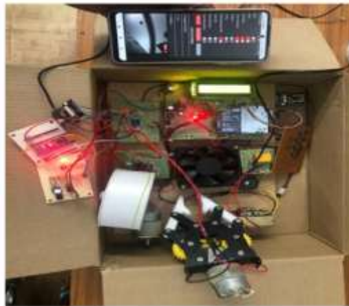
Fig 5 Output of Stage Ii Result

In stage 1 in this project, it contains of gases sensor which is used to find any harmful gases near the child and it equipped by temperature sensor which is used to find temperature near the child. Those gases and temperature are displayed on the display. By the stage 1 we are ensuring that the child is in safe place or not.