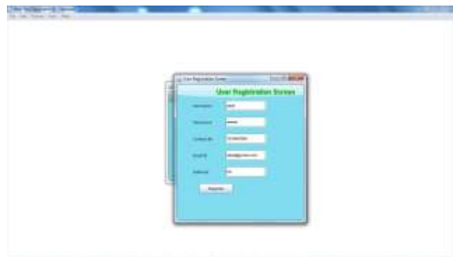
Fig 3.5 Click on Register for User Registration