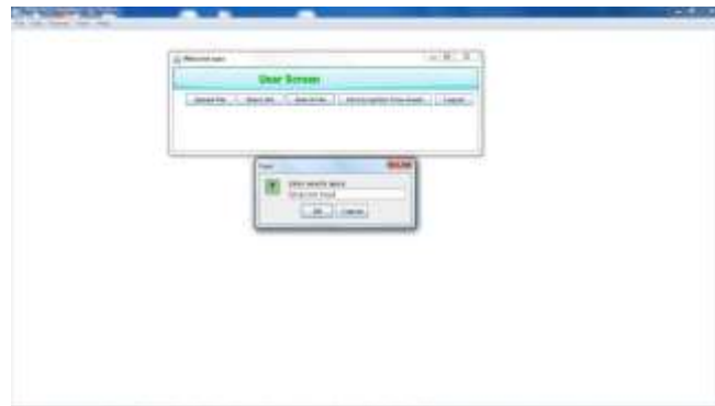
Fig 3.7 User Search Query Screen