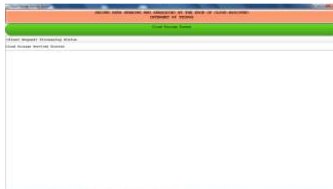
Fig 3.1 Cloud Server