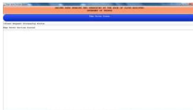
Fig 3.2 Edge Server