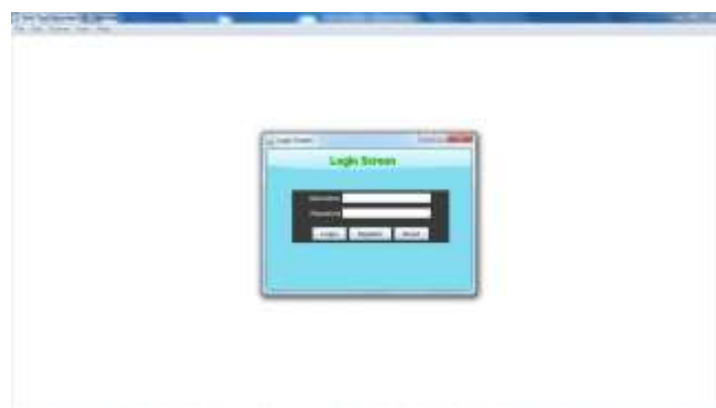
Fig 3.4 Smart Device Application