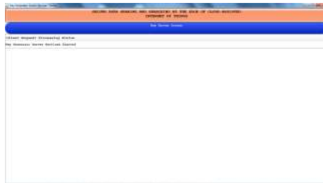
Fig 3.3 Key Generator Server