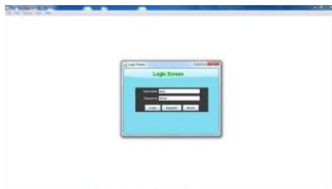
Fig 3.6 Login as Registered User