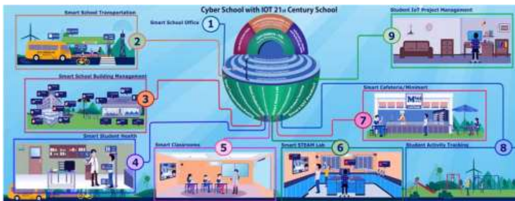
fig.1 IoT in Education

The Internet of Things (IoT) is a very smart part of today's schools, especially universities and classes, because it helps schools get better while also raising costs for services and systems. A mysterious university has the advantage of being able to easily give each person more detailed information. For example, [20] Smart phones and tablets are used all over campus to connect to the Wi-Fi network and send and receive information and orders. Additionally, the computing IoT devices for facilities and learning facilities help make better lesson plans, keep track of key resources, improve admissions records, create safe schools, and more. The Internet of Things will soon be used in more and more schools. Furthermore, [21] say that many schools use this to teach their students in order to help them understand things better. Other schools may use it to store information, save resources, or meet other similar needs. [22]. If the Internet of Things is going to be used in schools, we will have to change how we think about school.