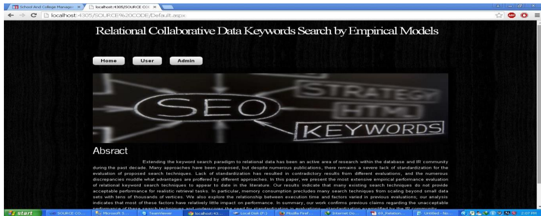
Fig 6.1: This is the homepage