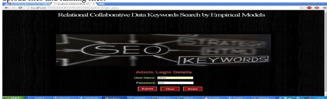
Fig 6.2: This is the admin login page

The purpose of this module is to provide a centralized place where information for the system can be stored, manipulated, and accessed. This module is created to centralize and encapsulate all data storage and retrieval duties on the system. This includes user profiles, upload files and ranking files.