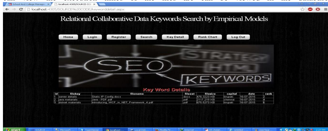
Fig 6.3: This shows file length has been read in KB format and execution time page

The purpose of this module is to uploaded files to search for keywords wise. The user can view the execution times of the tiles are can be viewed in the database.