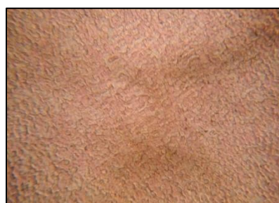
HRBC in Hypertonic Solution