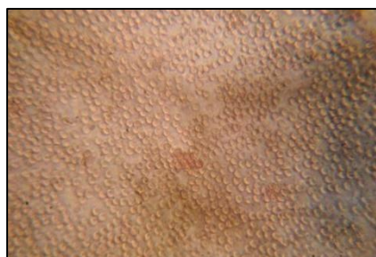
HRBC in Isotonic Solution Control