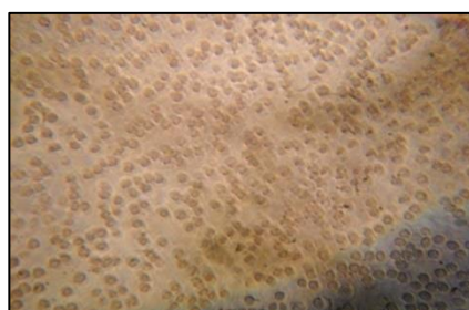
RBC in Hypertonic solution with polyherbal extract (6mg/ml)

(Protection of Hypertonic induced HRBC membrane lysis)