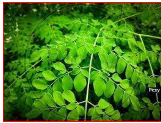
Figure 1A: Showing M. oleifera whole plant Figure 1B: Showing leaves of M. oleifera

Several studies have shown that the aq. extracts of M. oleifera leaves possess a wide range of biological actions including antioxidant, tissue protective, cardioprotective, hepatoprotective, neuroprotective, 19 analgesic, 20 diuretic, 21 antiulcer, 22 anticancer, 23 antidiabetic, anti-inflammatory, 24 antimicrobial, 25 antihypertensive, 26 and immunomodulatory effects. 27 With this background, the present study was designed to assess the antidiabetic potential of leaf parts of M. oleifera through in-vitro experimental methods such as inhibition of carbohydrate hydrolyzing enzymes namely, alpha-amylase and alpha-glucosidase.